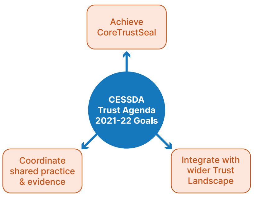
Diagram 1. The Trust Roadmap's Three Goals

Diagram 1 shows the three goals of the Trust working group.