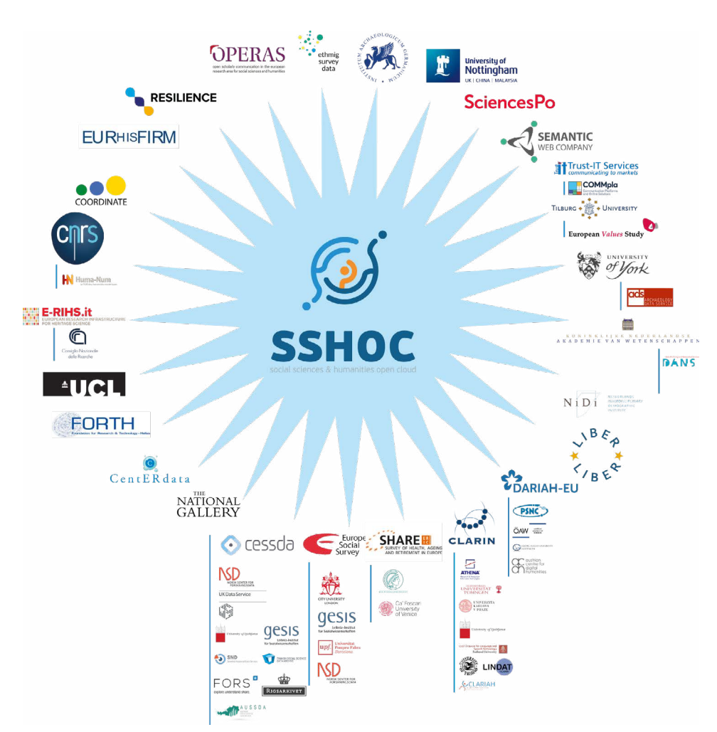
Figure 3. SSHOC Consortium

The <u>SSH Open Marketplace</u> is a discovery portal which pools and contextualises resources for Social Sciences and Humanities research communities: tools, services, training materials, datasets, publications, and workflows.